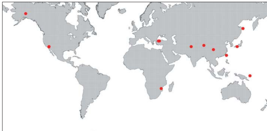
Fig. 2. Earthquakes on land with documented surface slips of greater than 1 meter during the past 20 years. Similar earthquakes in the future should be evaluated as candidates for rapid response drilling.