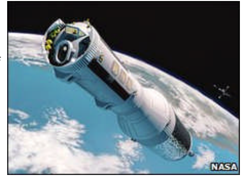
Very big rockets might not be needed if spacecraft could be fuelled in orbit

orbit technologies required to store cryogenic liquids and transfer them from one spacecraft to another, perhaps robotically.