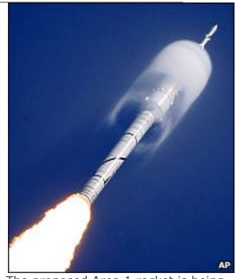
The proposed Ares-1 rocket is being cancelled by Mr Obama

US space agency Nasa has already spent $9bn (£5.6bn) on the programme.