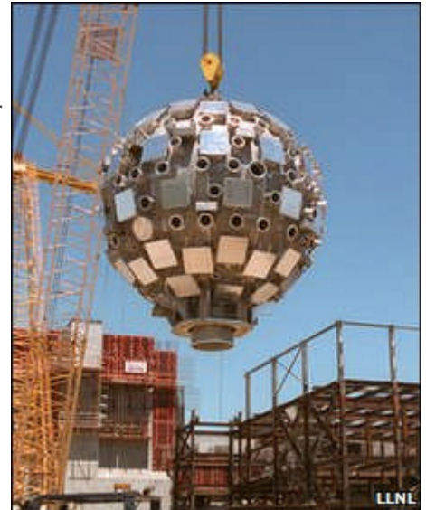
The 130-tonne target chamber is kept under vacuum for the experiments